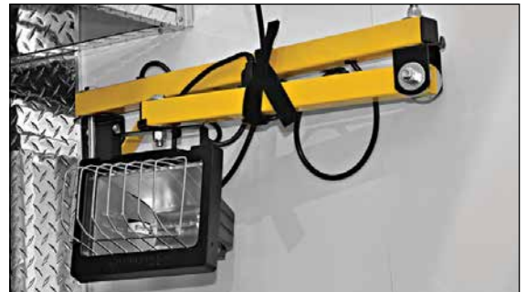
Swing Out Interior Quartz Light