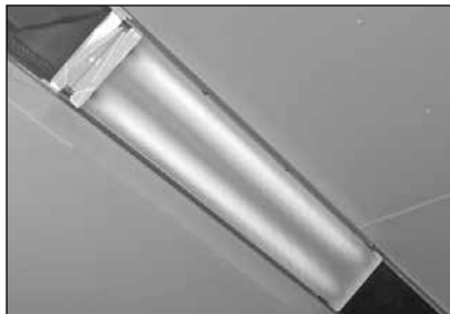
Raceway Mounted 4' Fluorescent Light w/Diffusers