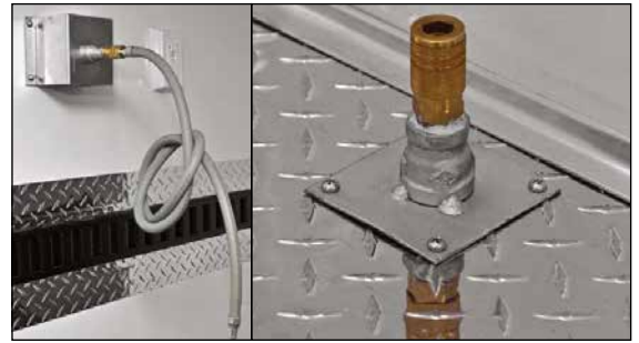
Quick Connect Air Line Fittings