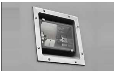
Exterior Quartz Light