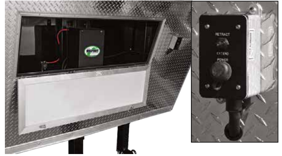
Hydraulic Leveling System