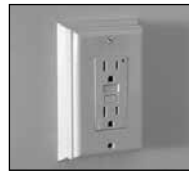
Interior and Exterior GFI Outlets