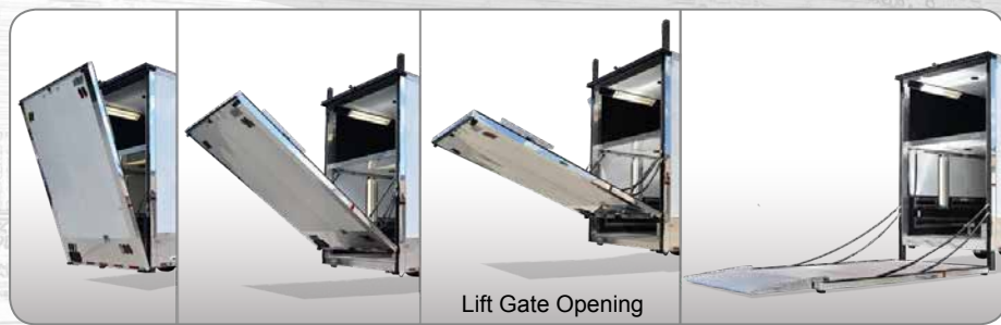
Lift Gate Opening