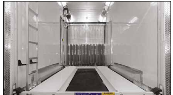
Gemini Lift System