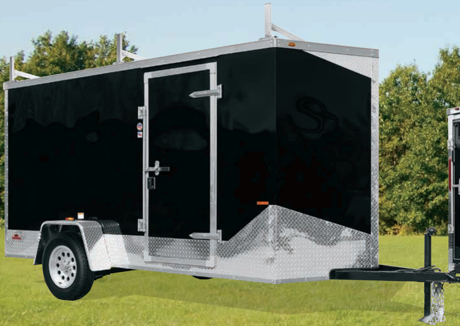
Shown With Optional "Flash Package", Mod Wheels, Screwless Metal and Ladder Racks The "Flash Package" contains the 12" tall ATP on the sides and a flush RV door lock