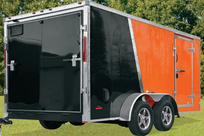
Shown With Optional Screwless Two-Tone Metal, and Series 14 Wheels